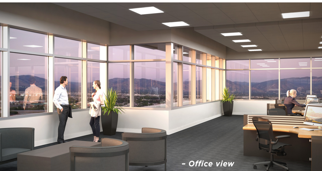
- Office view