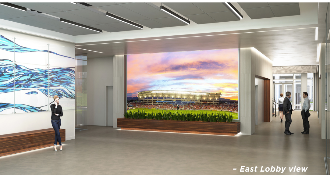
- East Lobby view