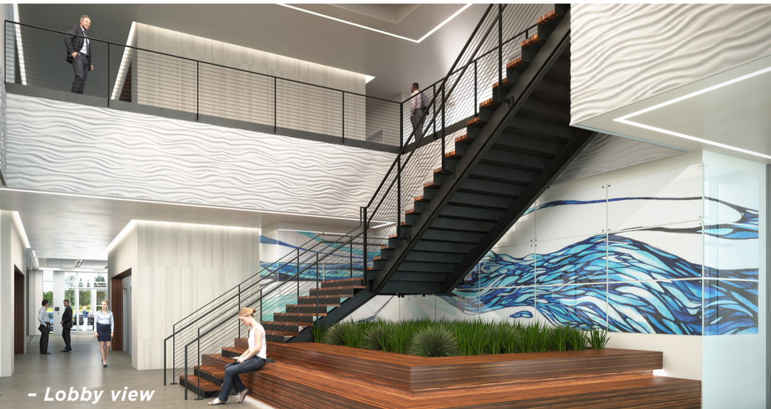
- Lobby view